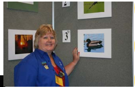
Environmental Photo Contest