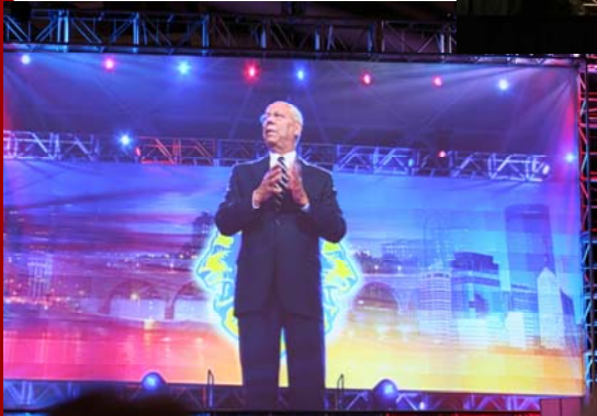
Colin Powell speaking during the convention about the importance of volunteering.