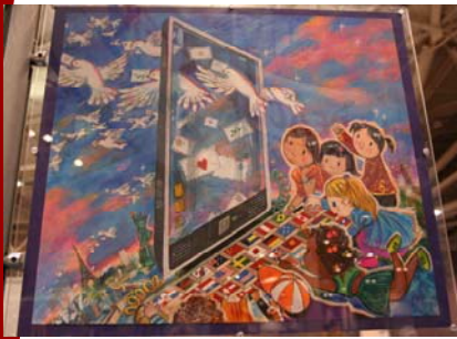
Peace Poster Winner