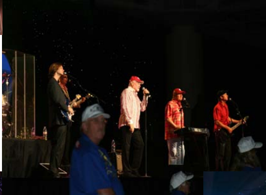
Beach Boys Concert