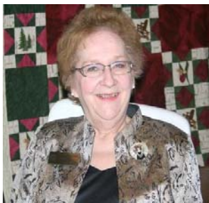
PEACE POSTER WINNER