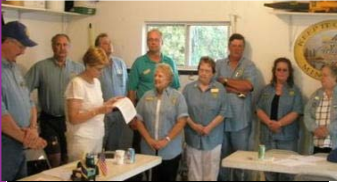
Fairhaven was DG Judy's first club visit.