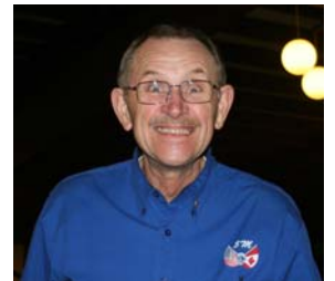
PARTNER IN SERVICE